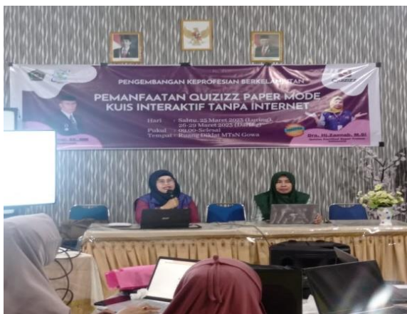
Figure 2. Submission of Quizizz media materials

The next activity is the provision of material about the Quizizz media application and how to make learning media using Quizizz media. The material is given using an interactive method, in which the material is given for each step and then the trainees try out each stage that has been explained. The presentation of the material ended with the participants trying to take quizzes using quizizz media.