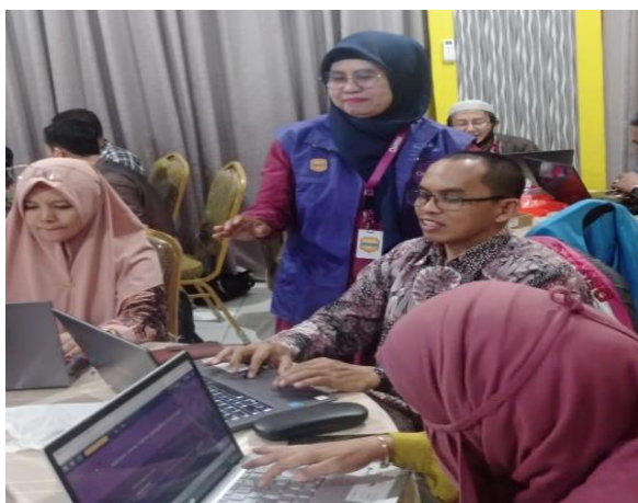
Figure 3. Assistance for Making Quizizz Media

After delivering the material, participants practiced making learning media using Quizlet. This practical activity was accompanied directly by the resource person. At this stage, participants are expected to be able to create a learning medium that can later be used during class learning.